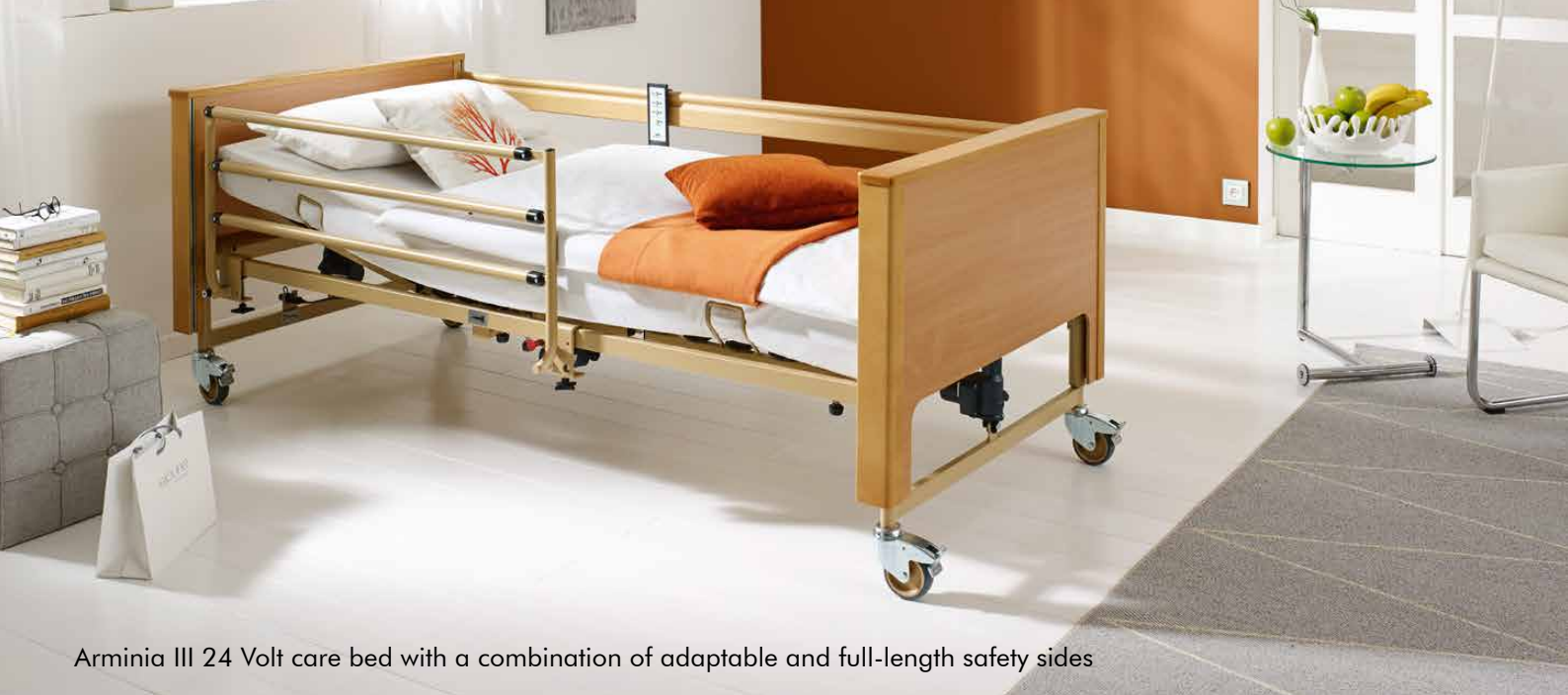
Arminia III 24 Volt care bed with a combination of adaptable and full-length safety sides