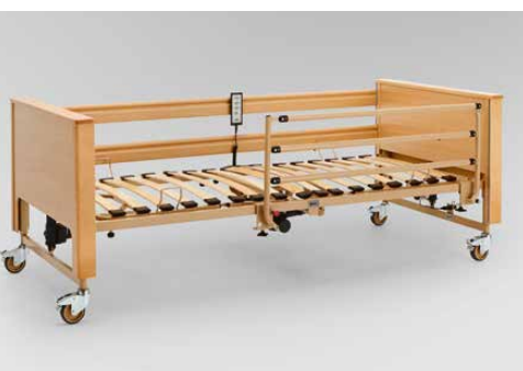
Adaptable safety side in higher position (right)