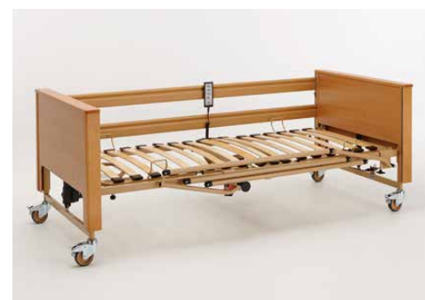
Adaptable safety side in lower position (right)