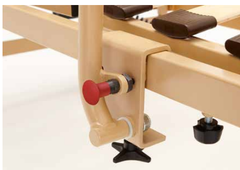
Attached with mounting brackets