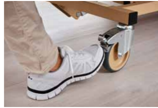
Individually braked castors.