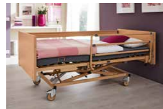
Adaptable safety sides.