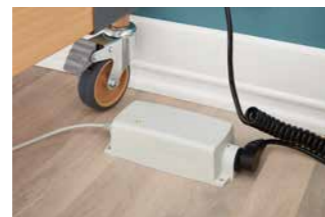
With the floor-mounted power supply unit, the 24-volt system can also be used with various international mains cables.