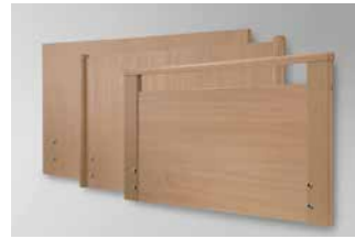
Choice of headboards and footboards: Standard (standard feature), Comodo with round posts (optional), Primero with handle bar (optional).