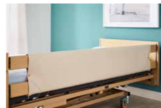
Foam leather cover.