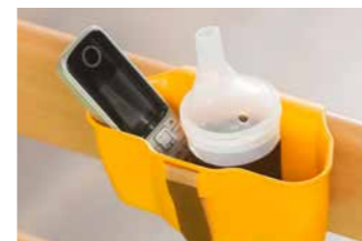
The storage tray for glasses, mobiles or the wireless handset can be attached at various positions.