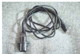
Extension cable for the handset (1.40 m).