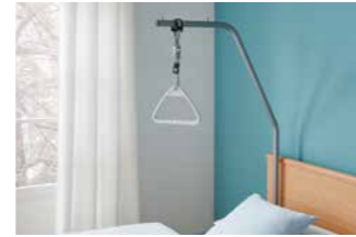
Patient lifting pole.