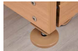
Wall deflection roller including mount.