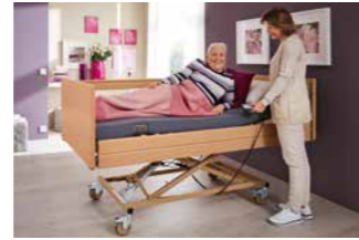
Height adjustment range 35 to 80 cm.