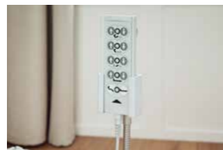
Flexible transmitter holder for the handset.