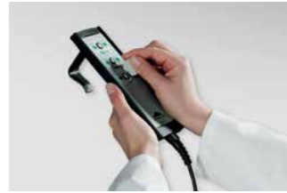
Handset with selective locking function.