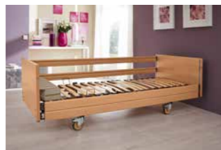
Bed extension including safety side bars (also for retrofitting).