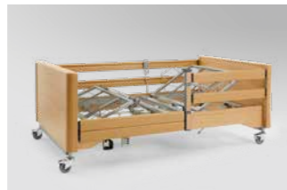
Combinable safety side.