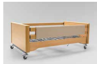
Foam leather cover for telescopic safety sides (TSG).