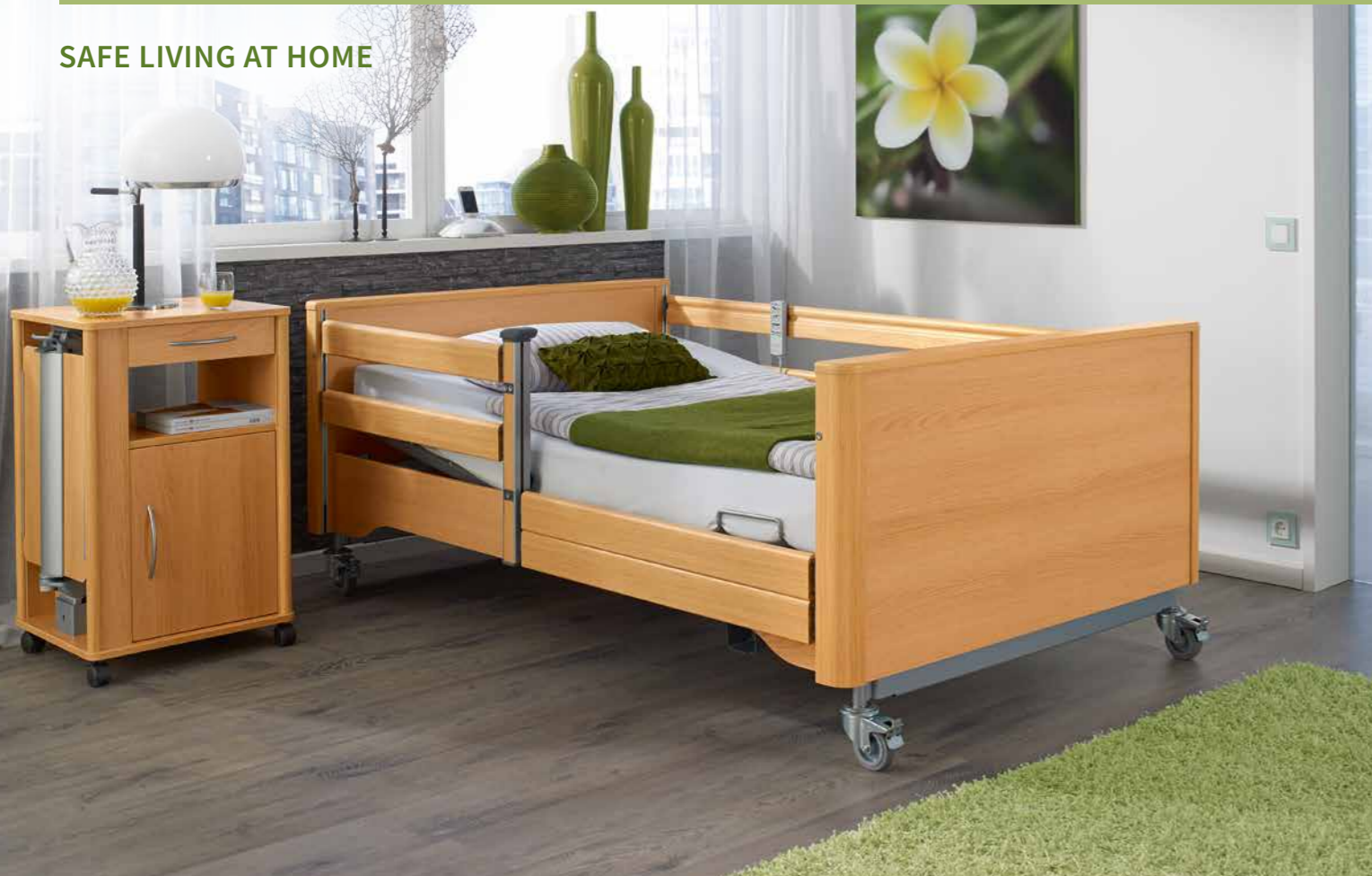
The heavy-duty care bed