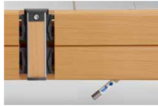
CPR release of the backrest.