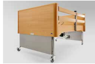
Plastic panels on the chassis for a more homelike feel.