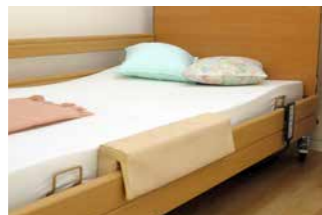
Extension cushion to place over the full-length safety side.