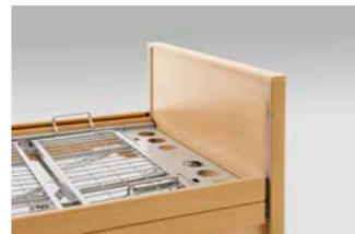
Bed extension including longer safety sides and side panels.