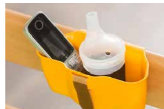
The storage tray for glasses, mobiles or the wireless handset can be attached at various positions.