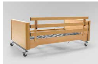
Clamp-on safety side bar.