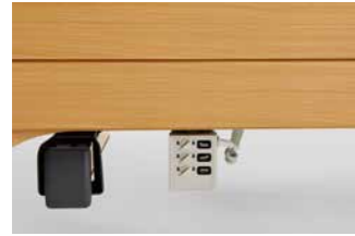
Holder for mobilisation aid (left) and locking box (right).